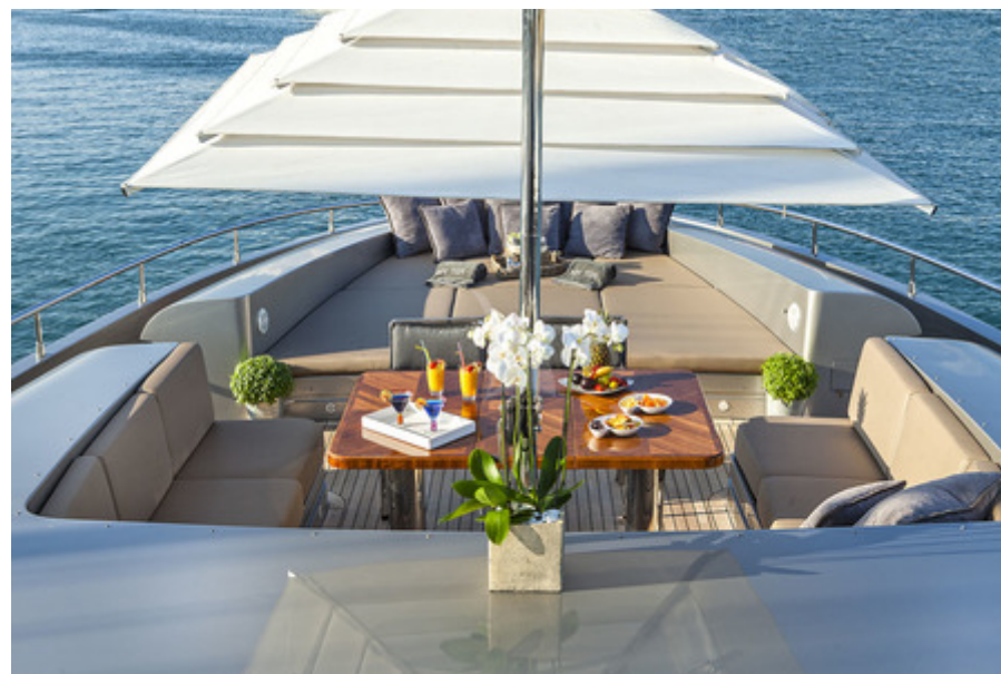
bow private space b