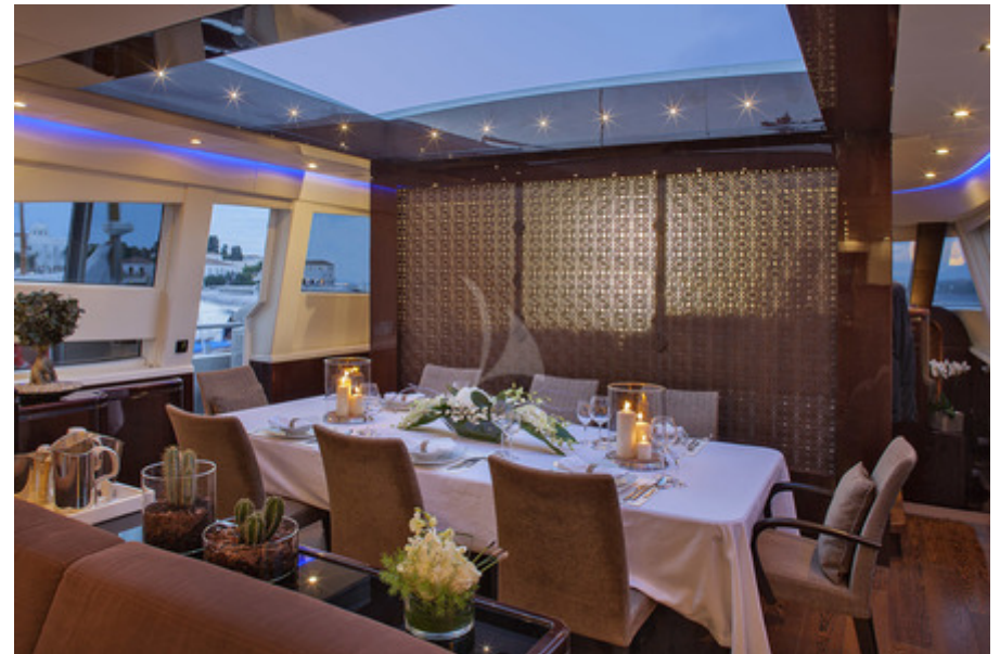
dining with open roof