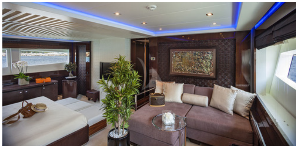
master presidential a