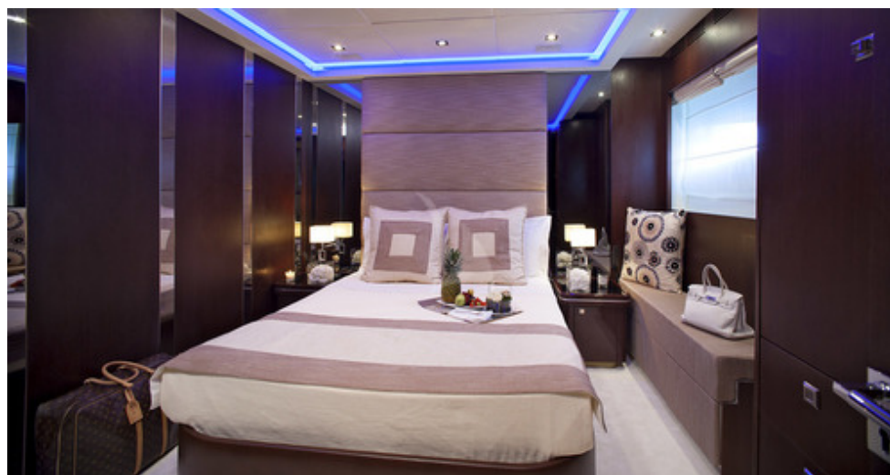
VIP II Suite