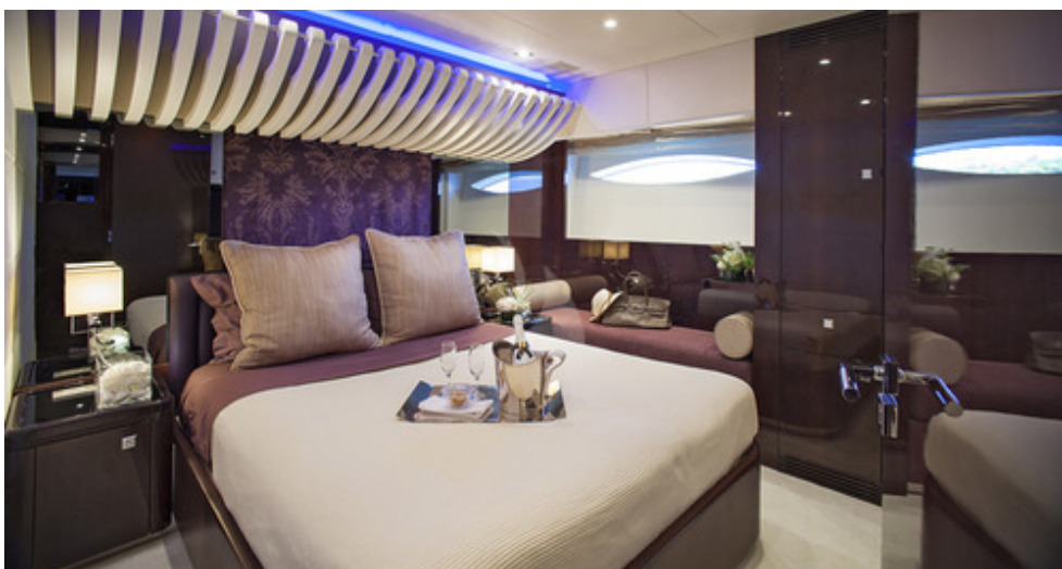
VIP I Suite