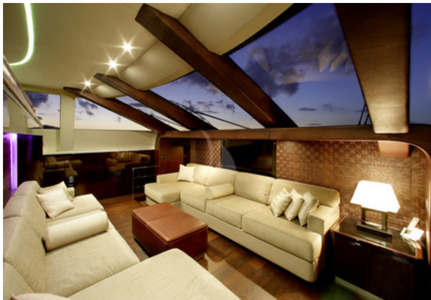
bow private playroom