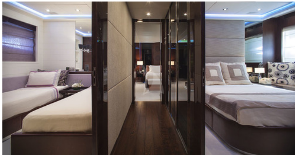
Parallel View VIP and Twin