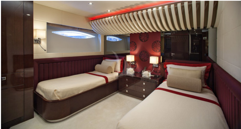
Twin II stateroom